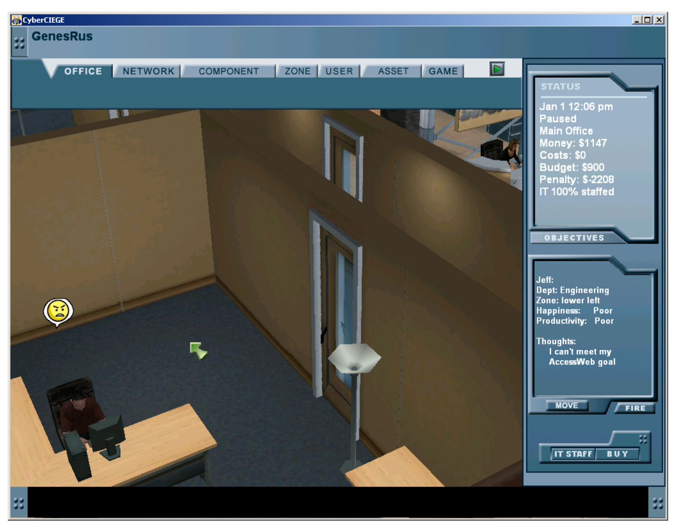
Figure 1: CyberCIEGE user at work