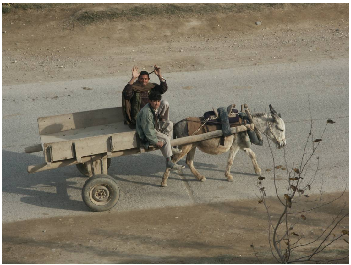
Rural transport in Balkh

UNOPS (United Nations Office for Project Services) is the implementing agency for road construction funded by the World Bank and Sida. UNOPS has an office in Mazar-e-Sharif; and a shared office with the Ministry of Public Works in Aybak and Saripul for the Sida-funded road projects. See Chapter 2.1 Roads, above.