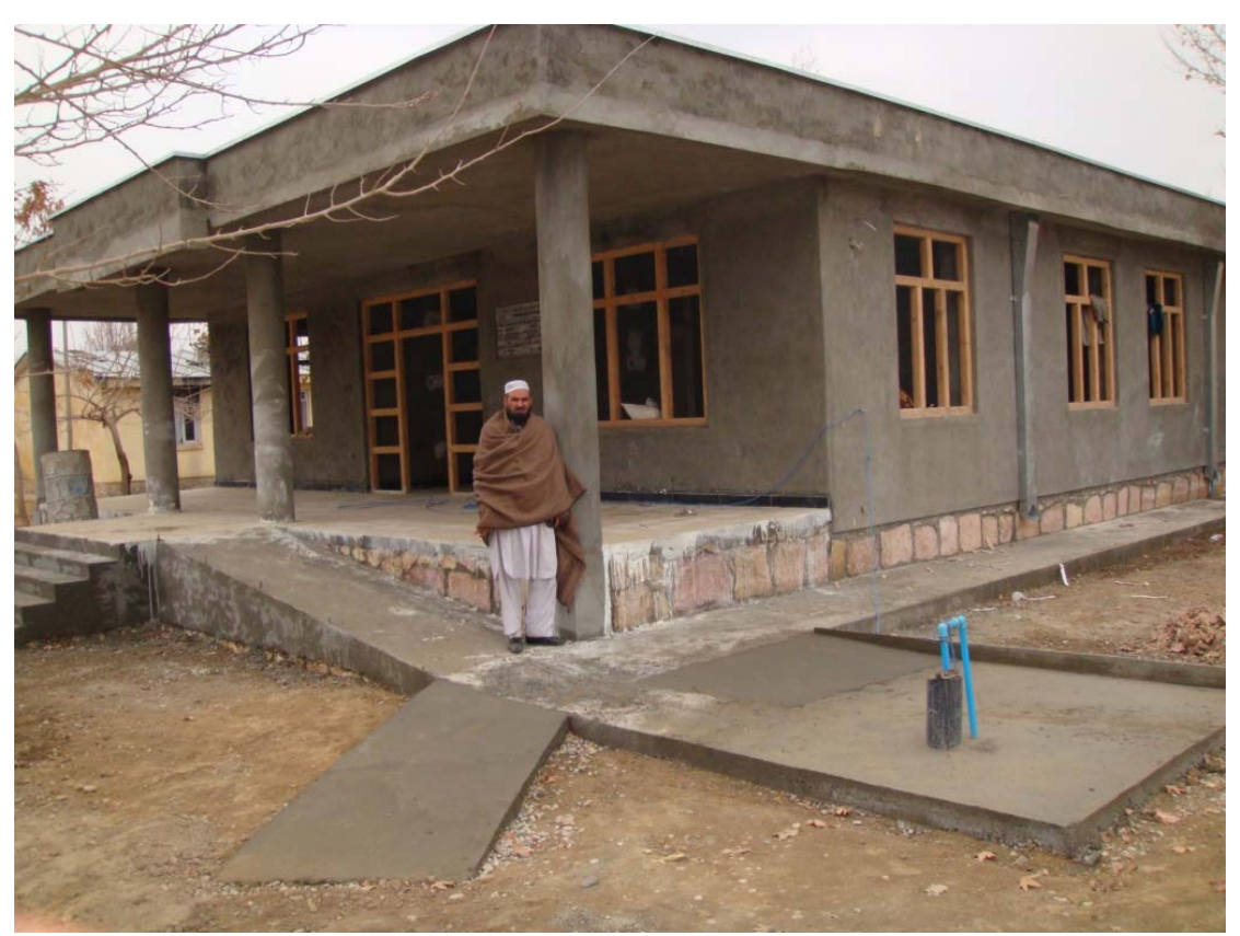
The new physiotherapy clinic built by SCA in Balkh district in Balkh province

Save the Children US. A US NGO active in training of midwives, teachers and administrators in Jowzjan, and training of teachers and administrators in Saripul. Implementing Partner (with Step&Move) in the BPHS in Jowzjan.