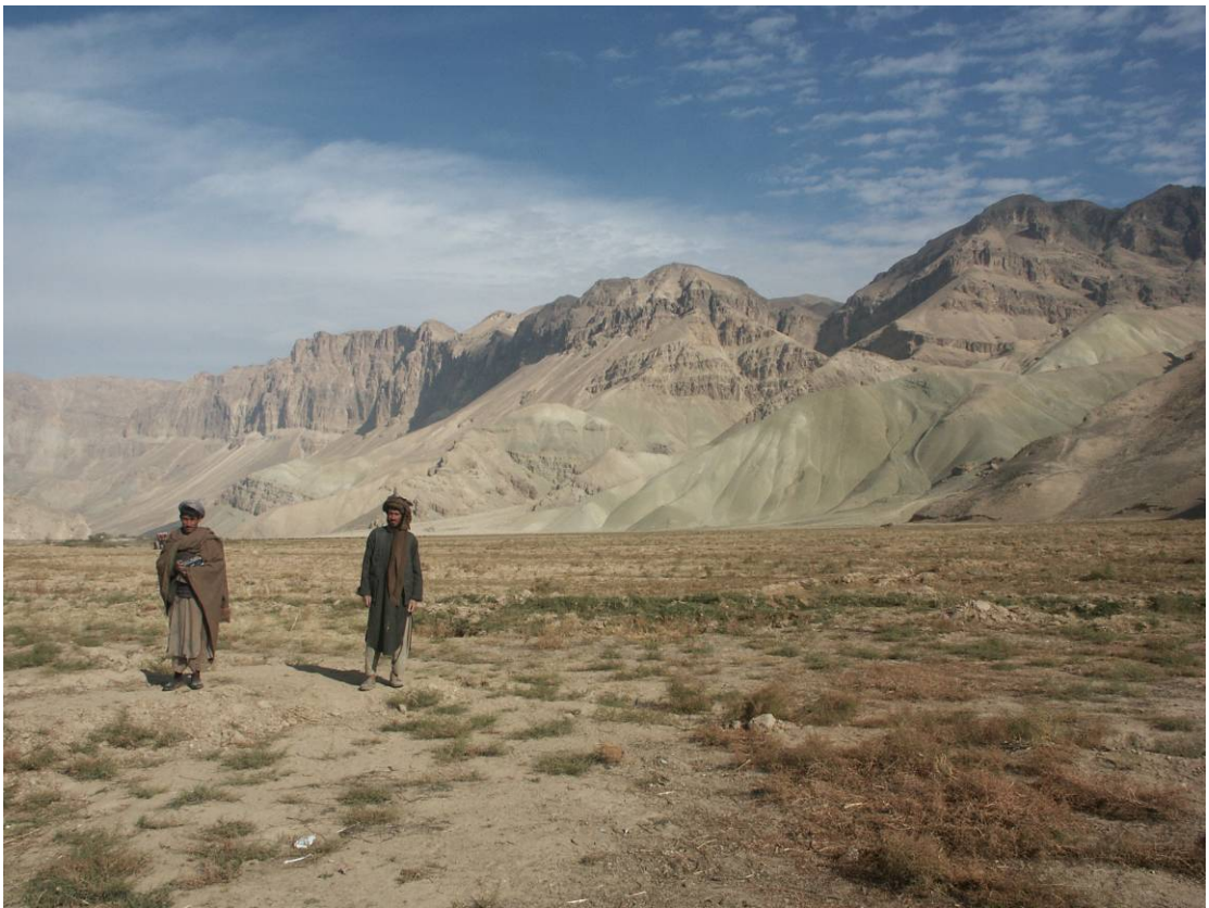
Samangan in summer

In normal years, the majority of the people in the province are engaged in cereal agriculture, especially wheat, rice and maize, and animal husbandry. Herbal products, for example caray and asfitida, are grown for export. Potatoes, vegetables, melons, cotton, oil seeds, sesame and strawberries are also grown. Mechanisation is at a very low level (RRERS, b, 2006). Drought resistant species such as almonds, apricots, pomegranates and pistachios are cultivated. In the past, the export of high quality almonds and pistachios was an important source of income for the province. Excellent almonds and pistachios are now cultivated with support from Afghanaid, but marketing is a problem. The almonds are bought at low cost by Pakistani traders who, in turn, sell them in Pakistan and India with a good profit.<sup>50</sup>