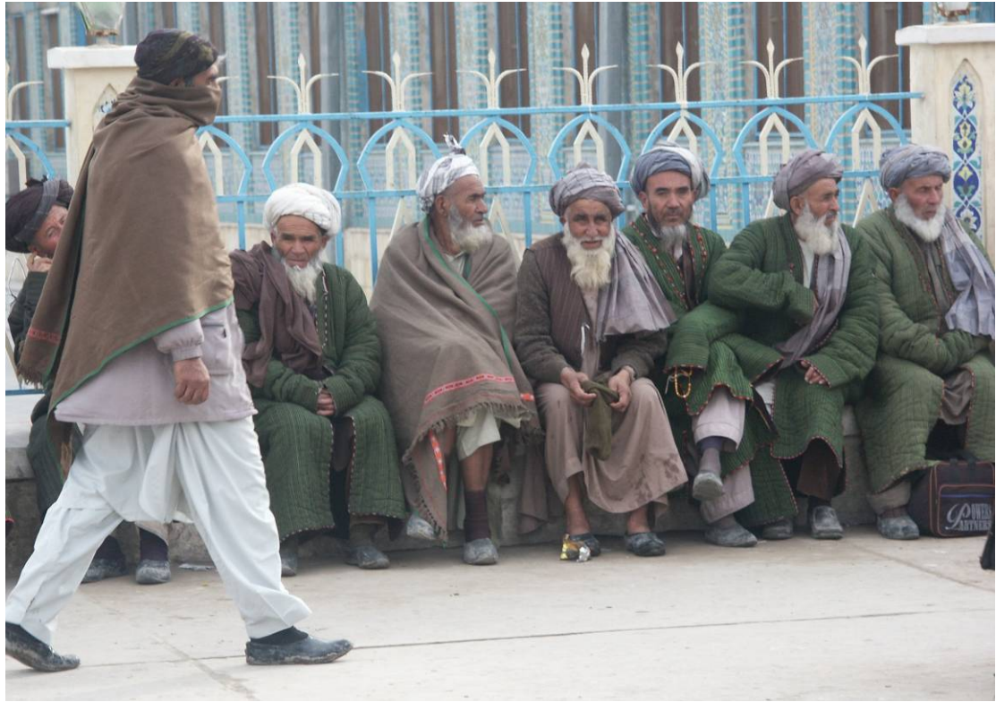
Whitebeards outside the Blue Mosque