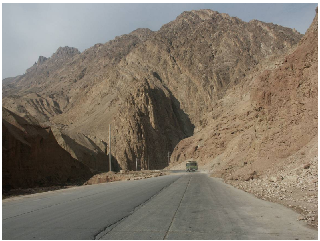
Samangan: the road between Aybak and Mazar-e-Sharif

The World Bank is now the leading donor agency in the road sector in the PRT Area. NRAP/NERAP is financed mainly by the World Bank/IDA, ARTF and the Japanese Social Development Fund (JSDF).<sup>33</sup>