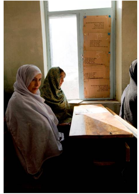
Women's education.

Strong social and cultural norms continue to limit women's role in society. In most communities, women are not allowed to leave the home without an accompanying male relative, so called mahram . Forced and underage marriages are common. Many women live in extreme isolation, further aggravated by lack of education and economic resources. Many adolescent girls die in childbirth, as their bodies have not reached full physical maturity. Rural women interviewed for this survey reported that constant pregnancies are a major difficulty in life. There is a huge need for increased reproductive health knowledge and access to such services in the PRT Area.