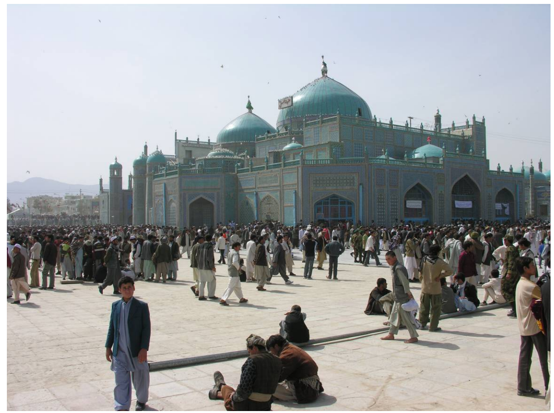
The Blue Mosque in Mazar-e-Sharif