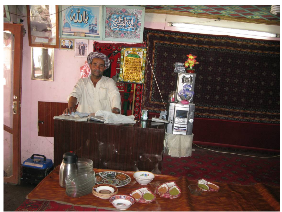
Teahouse in Aybak, Samangan

During the Taliban period, a wide range of war crimes were committed in Samangan, including horrendous massacres, the burning of whole villages and bazaars, food blockades and hostage-taking en masse of civilians. Human Rights Watch has reported that at least thirty-one Ismaili Hazara civilians were massacred near the Robatak pass in May 2000.