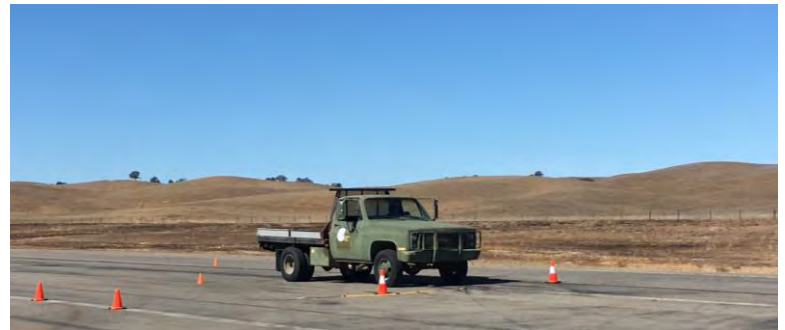
An MRAP and utility truck drive across ground sensors placed on the road as part of Carnegie Mellon University's Signal Extraction and Processing for sUAS Control Experiment. The Camp Roberts Regional Training Site - Maintenance provided the MRAP to participate in the experiment.