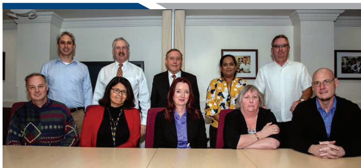
Members of the Inclusion and Diversity Council (IDC) are introduced to NPS senior leadership at the IDC's inaugural meeting and official launch, Nov. 8. The IDC focuses on monitoring trends, providing recommendations, and serving as a link between NPS senior leadership, management and employees, on all matters relating to inclusion and diversity.

As the IDC looks ahead to its next meeting, they plan on reviewing initial data, surveys and reports that the council members have access to as a starting point for identifying which inclusion and diversity issues and concerns are the most relevant and pressing to address.