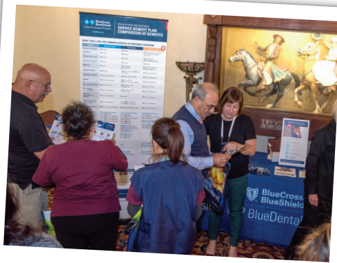
The Human Resources Office hosted a federal health fair in the La Novia Room, Nov. 6. The health fair brought together representatives from the major health, vision and dental insurers that have contracted with the federal government to provide benefits to federal employees.