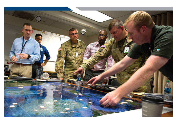
A diverse team of NPS students executes a sponsored wargame on a multi-domain task force at the request of U.S. Army Pacific during Wargaming Week. The effort represents the culmination of their studies in the operations research department's wargaming applications course.

"Can we do it? What can't we do from Australian ships? Can you land a V-22 Osprey on a Canberra class amphibious ship? How many, and what about maintenance,