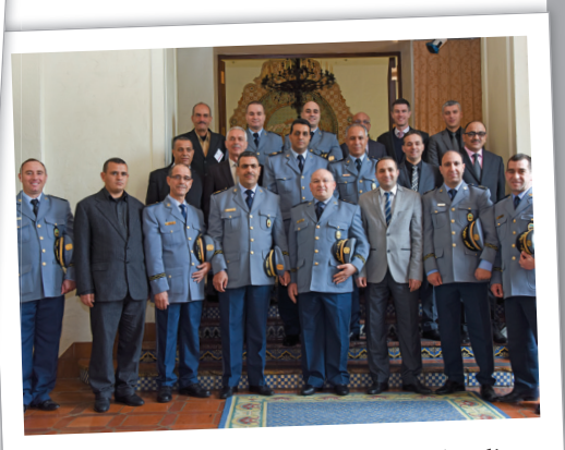
Algerian Officers in the Center for Civil-Military Relations Border Security Course pose for photo outside the Barbara McNitt Ballroom following their short course at NPS, March 13.