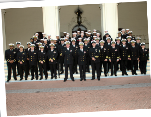
Naval Postgraduate School military staff pose for a command photo following a uniform inspection outside Herrmann Hall, Sept. 28. The Navy winter uniform shift to the dress blue uniform will take effect on Oct. 1.