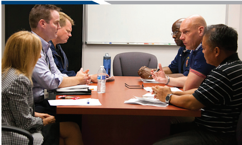
Attendees at the latest NPS Center for Executive Education (CEE) Navy Senior Leadership Seminar (NSLS) practice the craft of strategic negotiations during a course exercise. Held multiple times annually, CEE's NSLS provides Navy leaders with a range of emerging best practices in strategic leadership.

"I think I'd best describe it as a journey of discovery about myself: reconnecting with myself as a leader, what the Navy means to me, and what my job means to me," he added. "It's a recalibration of myself within the organization."