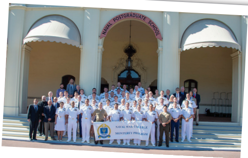
The 76th graduating class of the Naval War College (NWC) Monterey partnership with NPS for Joint Professional Military Education (JPME) stands for a group portrait on the steps of Herrmann Hall, Sept. 13, 2018. Through the partnership, 5,077 officers have earned this certification since the program's inception in September 1999.