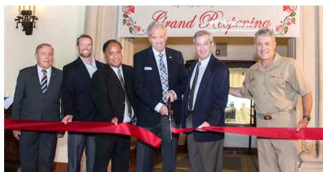
Officials cut a ceremonial ribbon, Oct. 4, marking the reopening of 77 newly-renovated guest rooms in the historic Hotel Del Monte, one of the Navy Gateway Inns and Suites' (NGIS) flagship properties, located on the grounds of Naval Support Activity Monterey (NSAM), and the Naval Postgraduate School (NPS).

The extensive project that began in 2016 included complete removal and rebuilding of guest room walls and ceilings and enlarged bathrooms with period-sympathetic tile. The entire infrastructure of this part of the hotel, including ventilation, heating, electrical, plumbing, fire protection and communication systems was replaced with state of the art equipment.