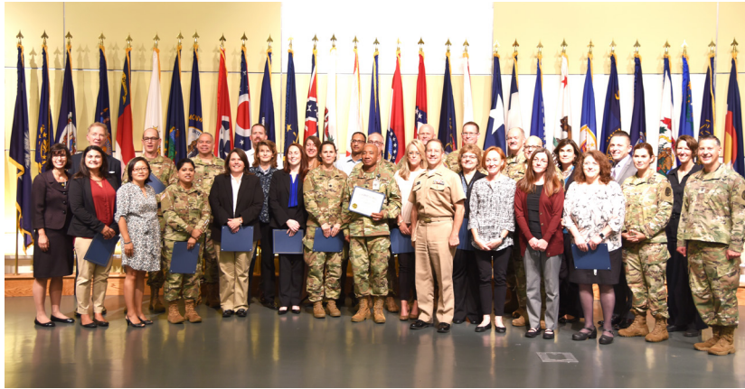
A cohort of 29 academic certificate students from the U.S. Army Medical Research and Materiel Command at Fort Detrick, Maryland celebrates the completion of their 12-month distance learning program in defense acquisition, the latest cohort through the Graduate School of Business and Public Policy's long-standing Advanced Acquisition Program.

The cohort included a wide range of acquisition professionals from several Army commands located at USAMRMC, all focused on critical areas of force health protection via medical device programs, pharmacological solutions, injury and disease prevention, and wound care and rehabilitation – including traumatic brain injury and post-traumatic stress disorder.