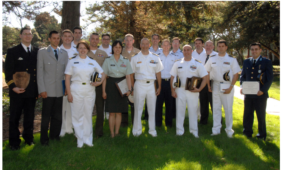
Several of the summer quarter's award winners gather following the presentation ceremony on September 15. A total of 35 students and four faculty were highlighted for academic and teaching excellence during the proceeding. For a complete list of summer quarter award winners, visit the NPS Web site at www.nps.edu .