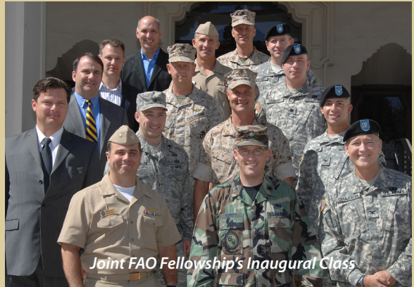
Joint FAO Fellowship's Inaugural Class

To sustain professional development and enhance the skills of seasoned FAOs, the Defense Language Office has partnered with NPS to create the Joint FAO Program. This advanced education program includes in-resident instruction at NPS and the Defense Language Institute in conjunction with a wide range of distance learning courses. The online home of the Joint FAO Community is FAOWEB, a dynamic online portal delivering continued education and providing a virtual community environment to network FAOs worldwide.