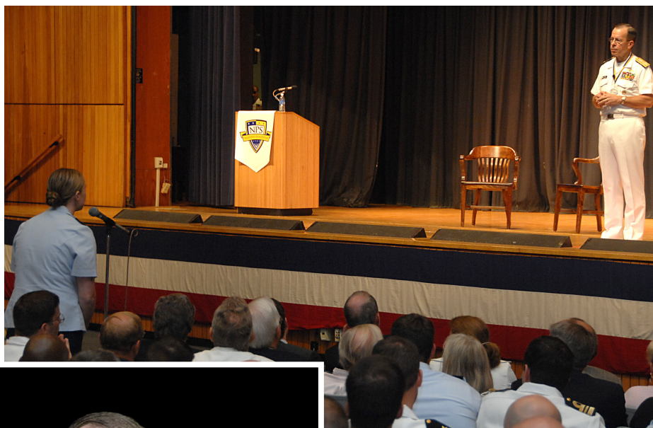
Above: Following the ceremony inducting him into the NPS Hall of Fame, Adm. Mike Mullen dedicated several minutes to answer questions directly from the university's students. Officers posed a range of tough questions, from issues relating to Tricare and family support to the current operation in Afghanistan.

Adm. Mike Mullen NPS '85 Operations Research Chairman of the Joint Chiefs of Staff