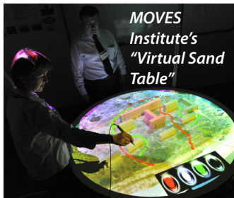
MOVES Institute's "Virtual Sand Table"

Roman's comments are not unlike many throughout the Department of Defense who have come to see the value in utilizing advanced synthetic environments for an expanding range of training and readiness requirements.