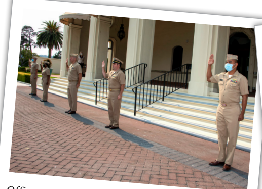
Officers take the oath of office during a promotion ceremony held outside Herrmann Hall, Sept. 1.