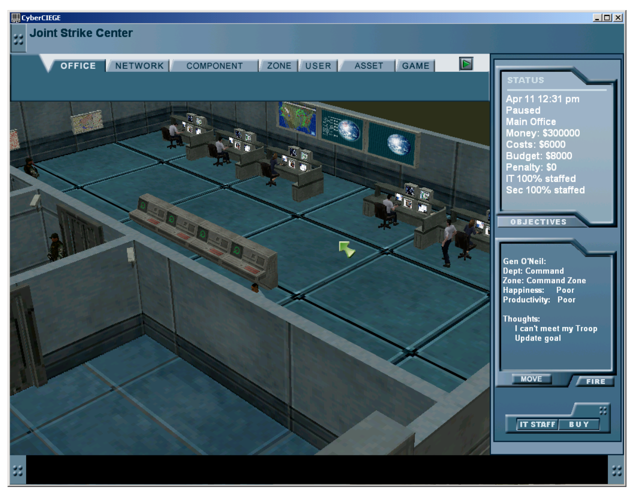
Figure 1: CyberCIEGE users at work

The second factor driving the creation of an extensible tool is to allow advanced students to create their own scenarios. Here, a student must make up an information security policy from whole cloth and imagine the kinds of tensions that could develop from trying to enforce the policy while letting users achieve their goals. This provides the potential for students to encounter