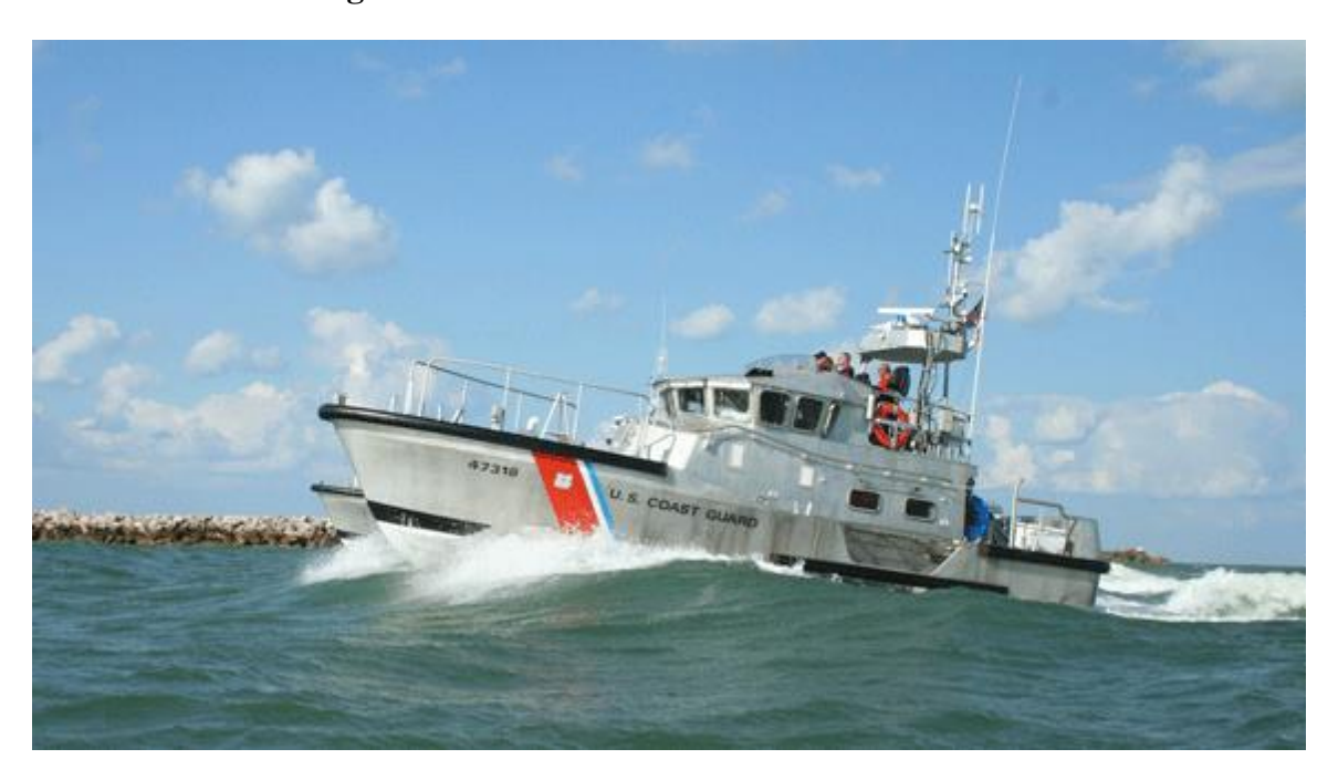
Figure 1AX: Standard 47 foot Motor Life Boat

Notes: Photograph courtesy of the U.S. Coast Guard, 2012